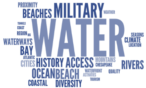
What is one thing that makes the Hampton Roads region a unique place compared to other places you could live in the United States?

When people talk about these assets and experiences, they do so from an emotional perspective, how these place attributes make them feel about living here. A key word that’s often used in these descriptions is “connection.” Like no other city or region, people feel this region is a place where it’s easy to CONNECT – to one another, our coastal environment, our country, and the world.